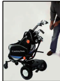
9. Power on the cart and handset to initialize.