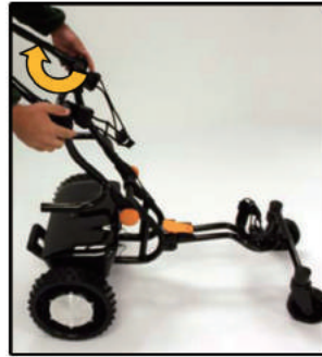
5. Loosen black knobs to position push-handle. Tighten all knobs.