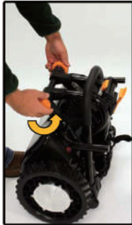
2. Loosen color knobs.