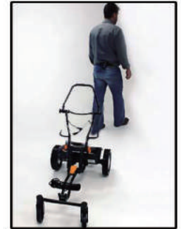
10. Clip handset to your belt, exposed and let the CaddyTrek follow you.

For best results, charge battery fully and do not cover the handset with clothing; stand directly behind the CaddyTrek to initialize handset.