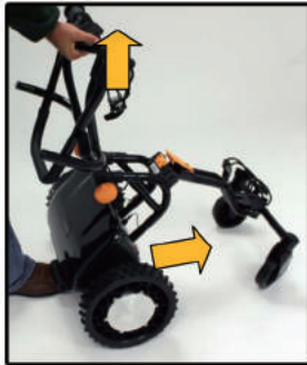
3. Place foot under base and raise handles. Wheels will move forward.