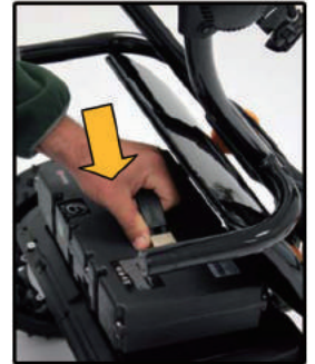
8. Insert battery and push down into place.