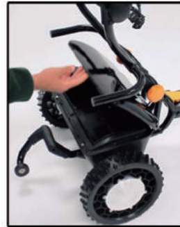
7. Lift battery cover.