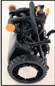
1. Place on flat surface.