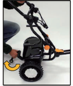
6. Extend 5th wheel (optional for enhancing balance on hills).